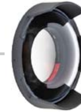
Dome Port 2 + Shede 2 Set