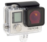
「Orange Filter」is installed