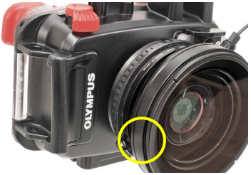
Proper strap eyelet position when locked