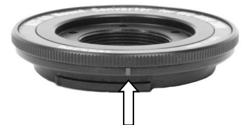
Guide A [camera side]